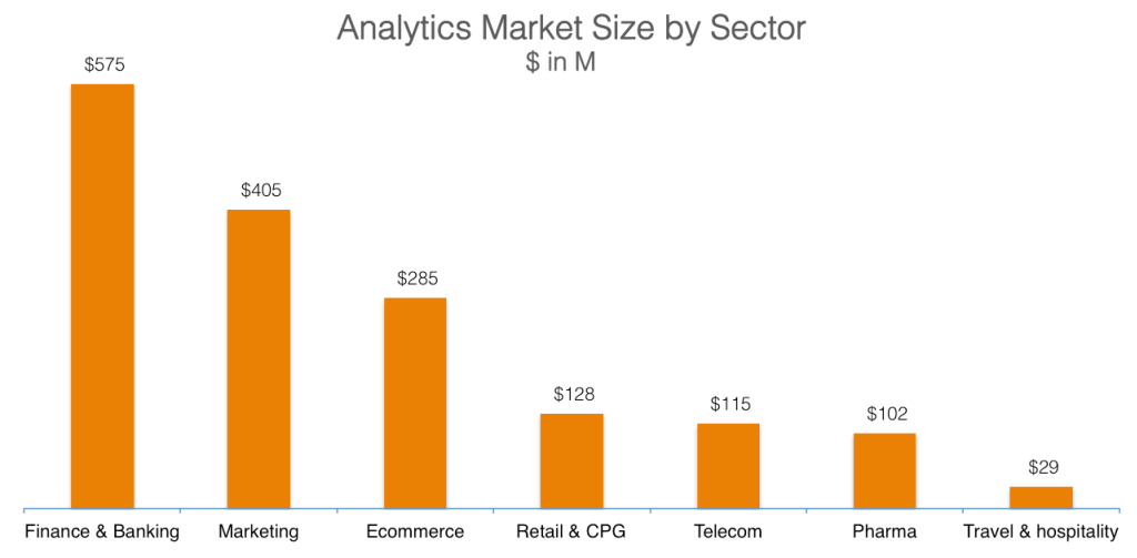
Figure 2 – Sector wise Analytics market size

Finance and Banking form the largest sector being served by analytics in India. Of the total revenue earned by analytics industry in India, 35% or $575 million comes from Finance and Banking.